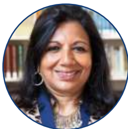
Dr. Kiran Mazumdar Shaw Patron