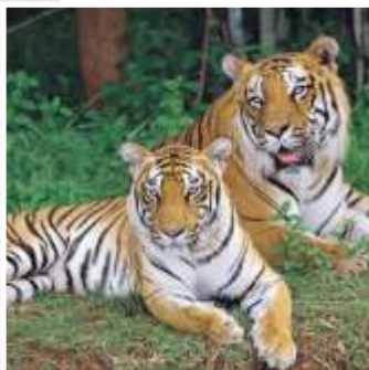
Bannerghatta National Park