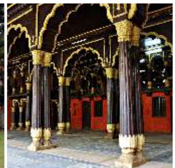
Tippu Sultan Palace