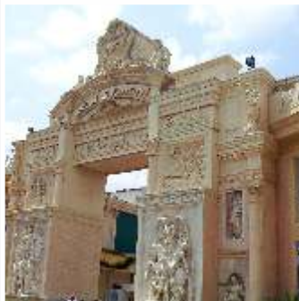
Innovative Film City

#2, NG Complex, 2nd Floor, 30th Cross, Bannerghatta Road Layout, Jayanagar 4th T Block, Bangalore - 560041, India T: +91 80 2608 0700 F: +91 80 2608 0702